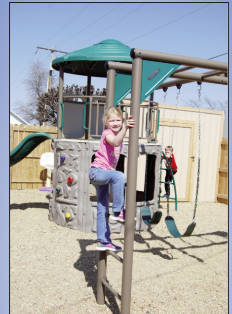
Sabetha Community Preschool