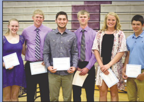
Nemaha Central B&B Legacy Recipients