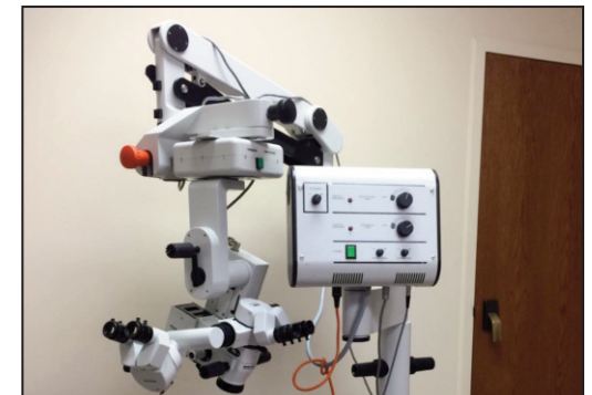
Nemaha Valley Community Hospital Eye Microscope